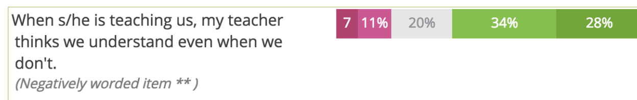
Figure 3: Example of Negatively Worded Item

More green indicates that more students disagreed with this statement. Whether the survey item is worded positively or negatively, more green is always better.