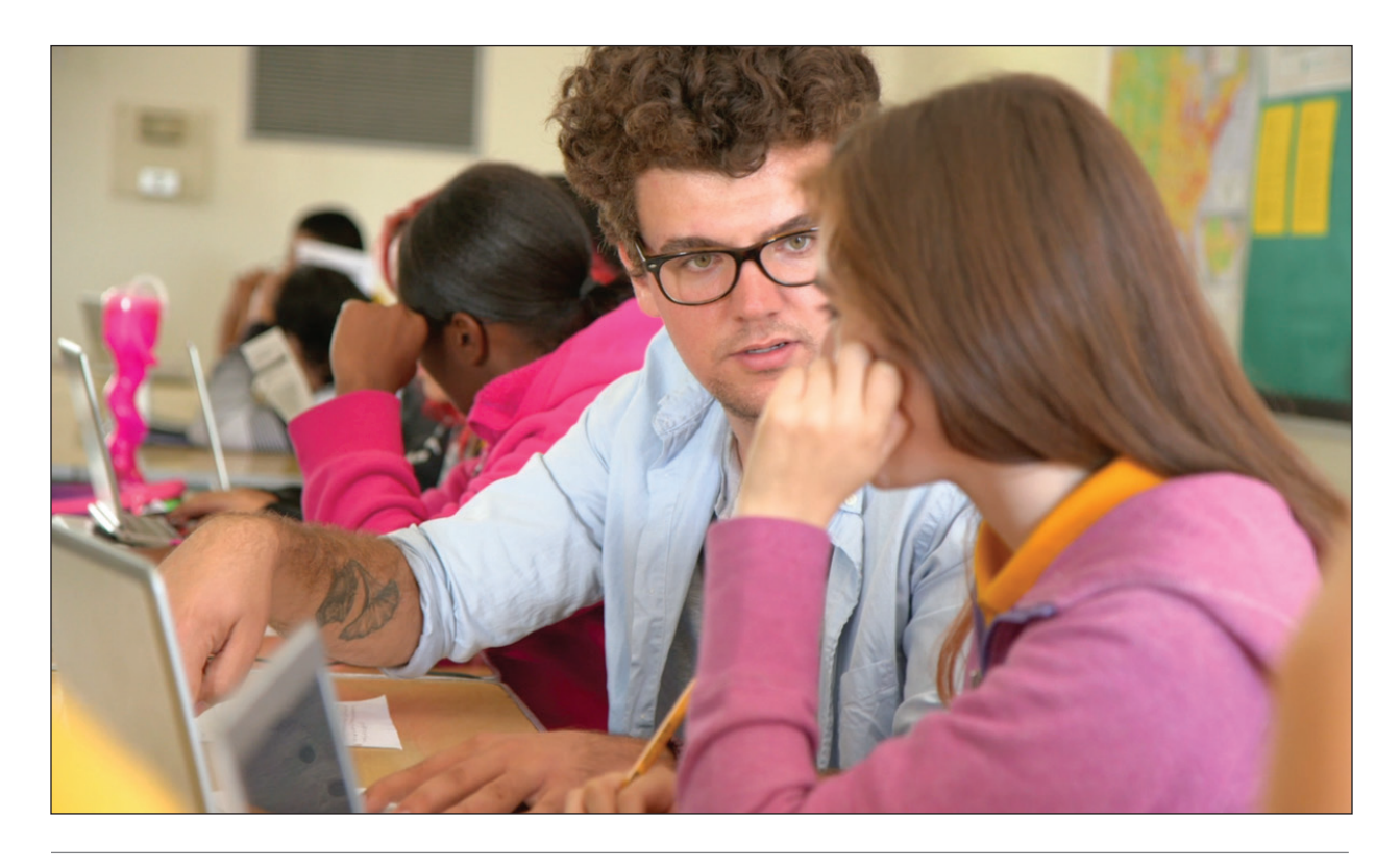
<sup>1</sup> Adapted from Looking Back to Move Ahead - M2 Communications.