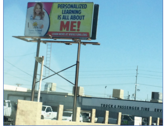
Yuma Elementary School District One sponsored billboards around the city celebrating the district's move to personalized learning.